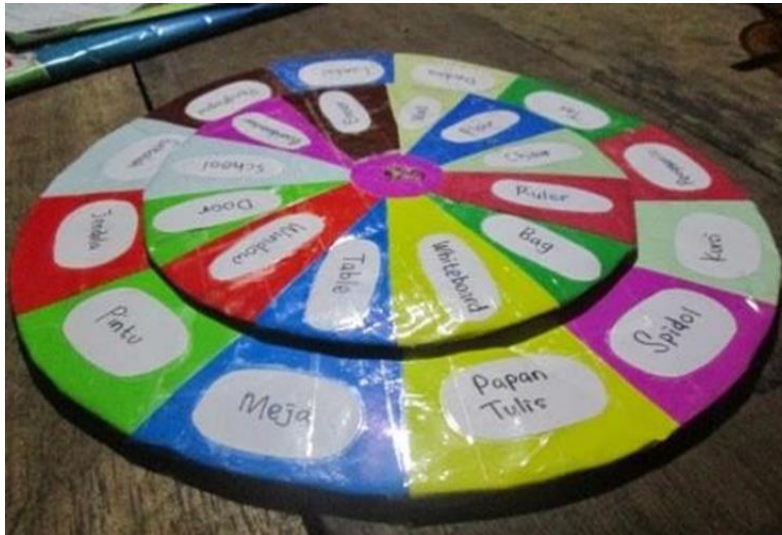
Picture 2. Media Board Spin based on Recycle System

Furthermore, creating learning media independently has many benefits, namely in addition to being able to adjust to the availability of the environment, it can also utilize objects that are no longer used to be useful. As the learning media above which is made of cardboard and used paper so that in addition to being used in learning English for children, it can also process waste more wisely. However, we must know whether media based on the recycle system functions and is beneficial for child development. So this study was conducted in order to obtain accurate data on how children's early reading abilities with use media based on recycle system on learning Language English early childhood. Recycle System -based turntable media can be seen in Figure 2.