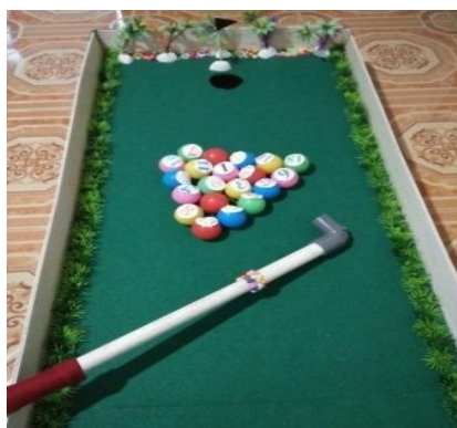
Picture 3. Tool Game Golf

Apart from aiming to win the game, in the game of Golf for children aged Early on, you can train fine motor skills in the form of the ability to develop good strategies. hitting or putting the ball into the target. In the gross motor skills of the game of Golf trains ability skill hand child For active And skilled do target in game. By learning through the game of Golf, children's cognitive knowledge and skills will develop optimally. Based on this information, the game of Golf can be applied in process learning on child age early. There is even media game Golf in studyThis in accordance with picture following This: